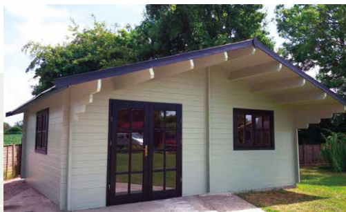
Picture supplied by customer on completion, 2 colour paint finish