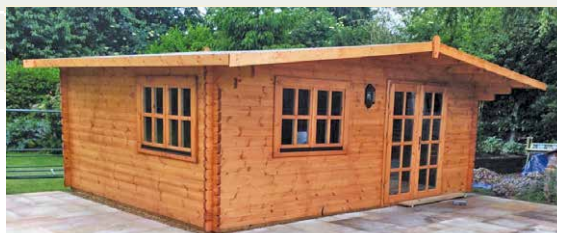
Picture supplied by customer on completion

Note: Dimensions are to exterior of wall (they do not include corner notches/overhangs)